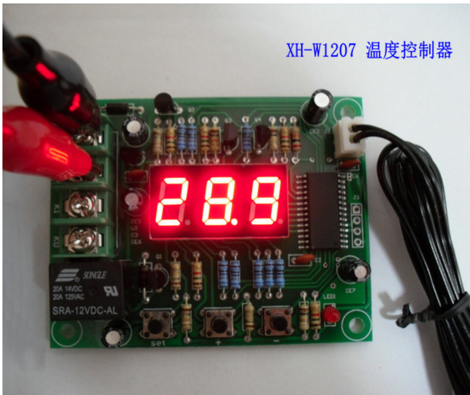
Here thermostat, electrical connection diagram